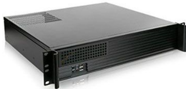
FreePBX 2U Rack Mount Server (PBX)