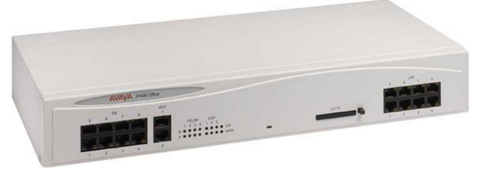
Avaya IP406 V2 Master Control Unit (PBX)